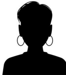
Sheila Sampson b. 31/12/39