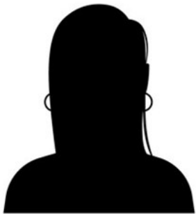
Poppy Blackgate b. 11/11/03