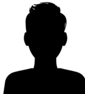
Tempus Fugit b. 28/5/49