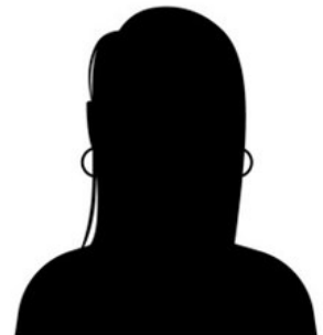
Fiona Alderson b. 25/1/64