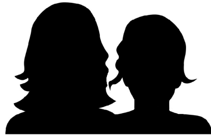
The Guides b. 2008