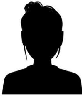
Nora Parsons b. 9/9/72