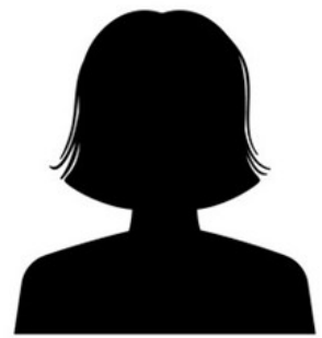
Daisy Thomas b. 12/6/10