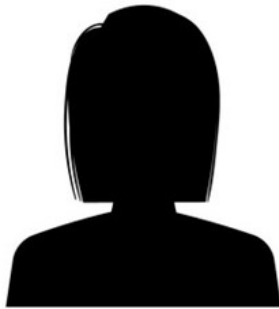
Eva Gallhill b. 16/9/29