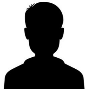
Charleston Crow b. April '44